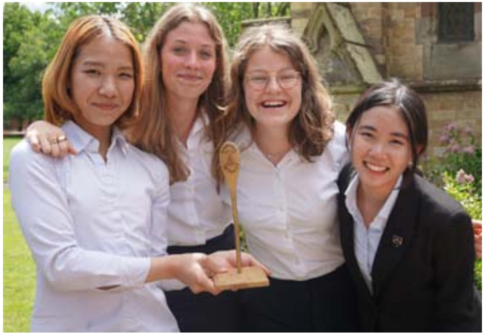
It was, as always, a very difficult decision but it was felt that the winning cake was very much a 'hands-on' effort from the entire Housman team.

The Headmaster, judging for his first time, not only asked the bakers to describe what they had made, but also the meaning of their cakes and about the actual cake mixture/recipe. He bravely tasted each one.